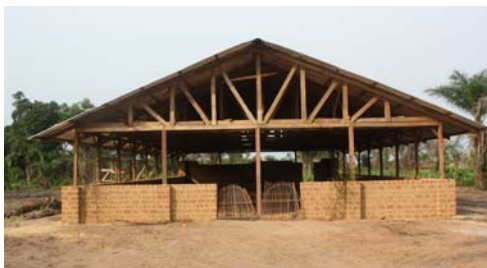
The new Tshumbe Church