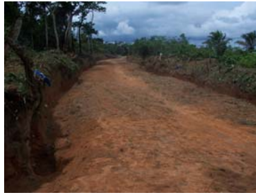
A rehabilitated section of road