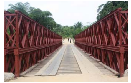
The Lokenye bridge rebuilt

We look to this coming year with a sense of hope and anticipation. God is providing excellent co-workers who are making so much of what we do possible. Together with you who pray for and support our ministry we feel that we are making a significant difference in the life of the Church and in the area we serve!