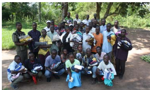
Pastors' School students receiving clothes for Christmas