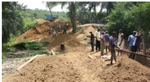
The dam under construction