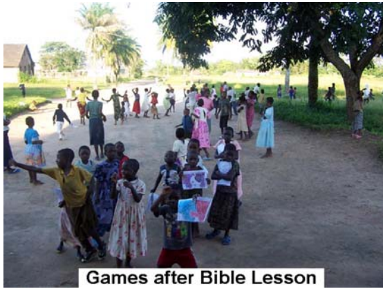
Games after Bible Lesson