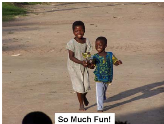
So Much Fun!